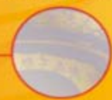
Image de sécurité Security image